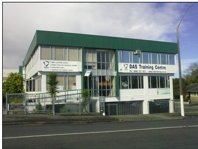
127 Kolmar Rd | Papatoetoe

For the latest student loan information visit www.studylink.govt.nz